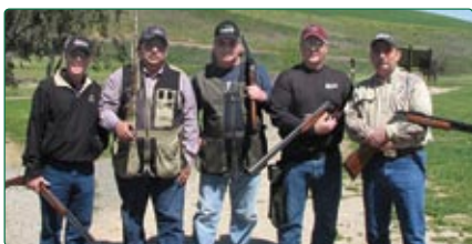
The JVIC West Coast Shooting team participated in the JVIC / Chevron Turnaround Shoot-Out this spring in Northern